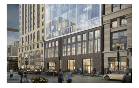
180 W Randolph