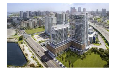
Vela Channelside Phase II

Urban high-rise mixed-use ±1.01 AC TAMPA, FL