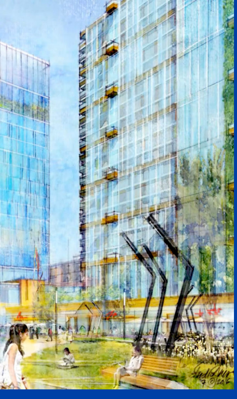
ABOVE Conceptual drawing of Project Catalyst, showing a street view

We brought in Stantec's Urban Places Group out of Boston, a specialty design team that works solely on large-scale infill mixed-use environments. We also consulted with a renowned land use attorney in Austin. Using these consultants, we designed an environment that suggested of mixed-use buildings and an average height limit of 90 feet throughout.