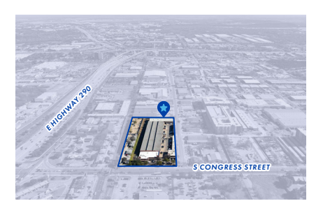
4201 S. Congress