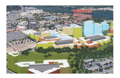
Project Catalyst Mixed-use redevelopment ±97.0 AC