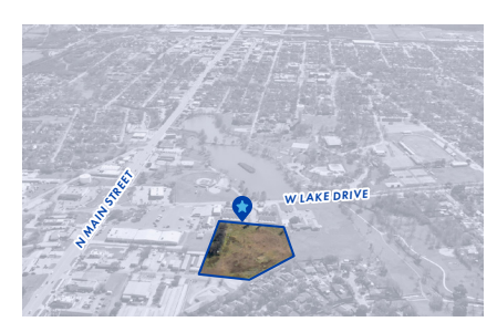
Taylor Development Site

BTR/Mixed-use, raw land ±1.96 AC TAMPA, FL