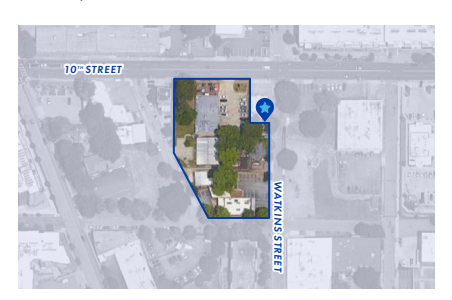
10th St & Watkins St Assemblage

Urban high-rise mixed-use ±1.3 AC ATLANTA, GA